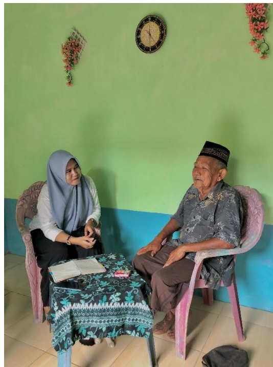
Figure 1. Interview Responden

The globalization of the spice market has had a significant impact on nutmeg farmers in Lonthoir Village. Nutmeg prices affected by international markets are often volatile, and competition with synthetic commodities such as artificial nutmeg is further pressuring farmers. Brown (1999) found that the globalization of the spice market leads to an increasing dependence on international prices, which risks harming local farmers. Hanatin, the village head, emphasized that the local government needs to be more active in helping farmers to get fairer market access. "We need to protect farmers from the international market price game. Government support must be more real," he said. This shows that although globalization opens up wider market opportunities, smallholders are often the most vulnerable to price fluctuations and unbalanced competition.