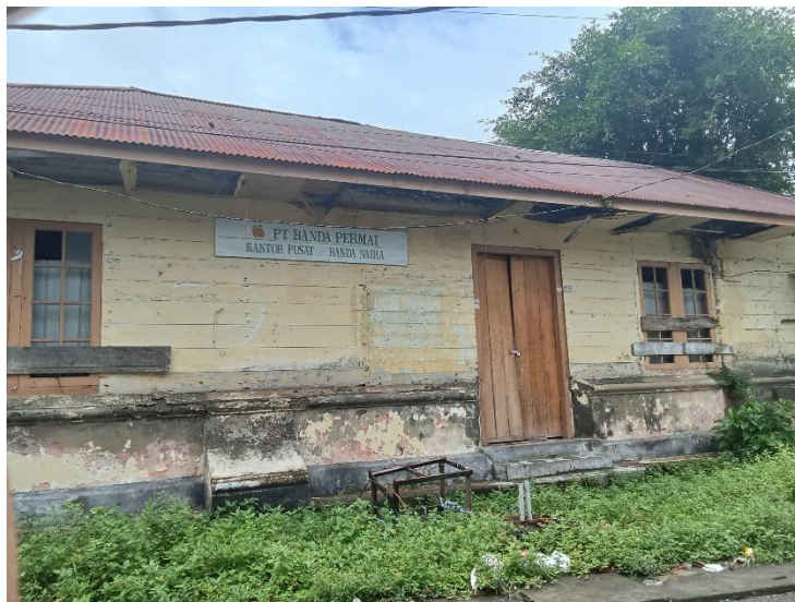
Figure 2 Office of PT Banda Permai

The photo shows the office of PT Banda Permai which manages nutmeg plantations in Banda District, but now it has become a vacuum, in the end the nutmeg plantations are managed by the nutmeg farmers themselves.