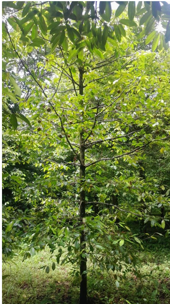
Figure 4 Nutmeg Tree

Nutmeg Tree, Lonthoir Village, Banda District, Central Maluku Regency, Maluku Province.