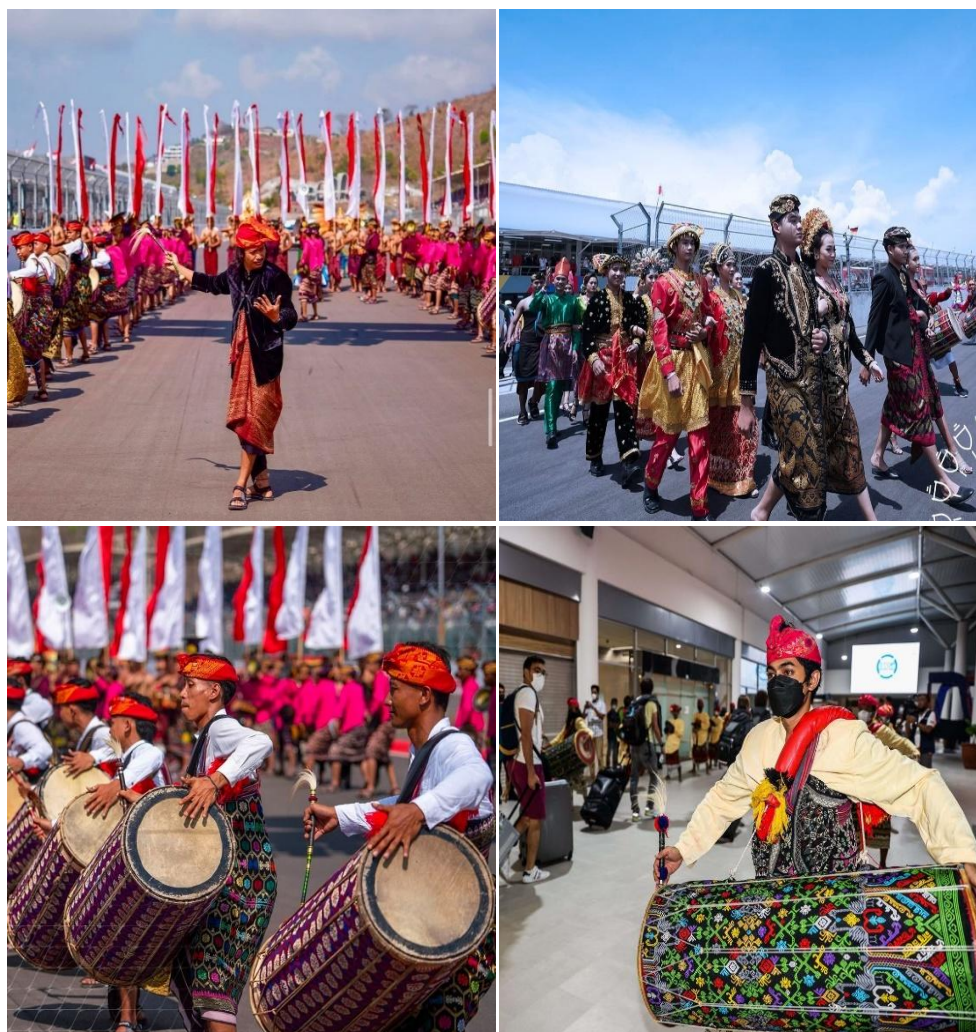
Figure 3. Lombok traditional dance performances and the national cost of parades at MotoGP events

The theoretical framework of cultural diplomacy, as conceptualized by Carbone (2017), provides a structured analysis through four key components: agent, agenda, vehicle, and target audience. In the Mandalika MotoGP, the agent component comprised multiple stakeholders, including the Ministry of Tourism and Creative Economy, the ITDC, the MGPA, and Dorna Sports, who worked in coordination with international bodies such as the FIM. This multistakeholder approach exemplifies the complexity of modern cultural diplomacy in international sporting events, where success depends on effective coordination between national and international stakeholders.